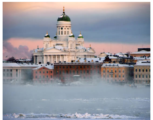
The Helsinki Cathedral

The Finnish climate is variable with its four distinct seasons: the fall foliage with infinite colors; snow and freezing temperatures in the winter; magnificent spring when nature awakes after the darkness and cold and of course, the never-ending days turning into white nights in the summer.