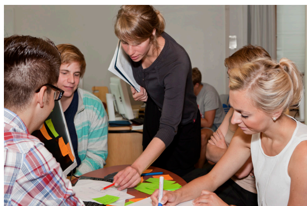
International Summer school 2012

ITP is an academic summer programme offered for selected university students and corporate partners. The ITP provides students with a strong applied understanding of Information and Communication Technologies (ICT). More info itp@aalto.fi