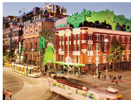
RMIT University City campus

Life at RMIT is filled with on and off campus events, over 100 clubs, student run media, sport competitions and more. You will be offered a range of support services and orientation activities to help you transition into one of the best personal and academic experiences you'll ever have.