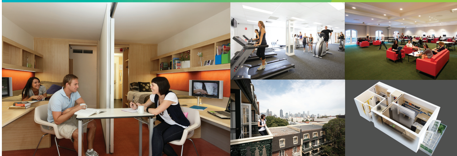
2 bedroom studio floor plan

RMIT Village is located near the heart of Melbourne CBD. Only a 5-minute tram ride from RMIT University and just across the road from the University of Melbourne, you can enjoy all the benefits of living in an exciting, culturally diverse and modern student community!