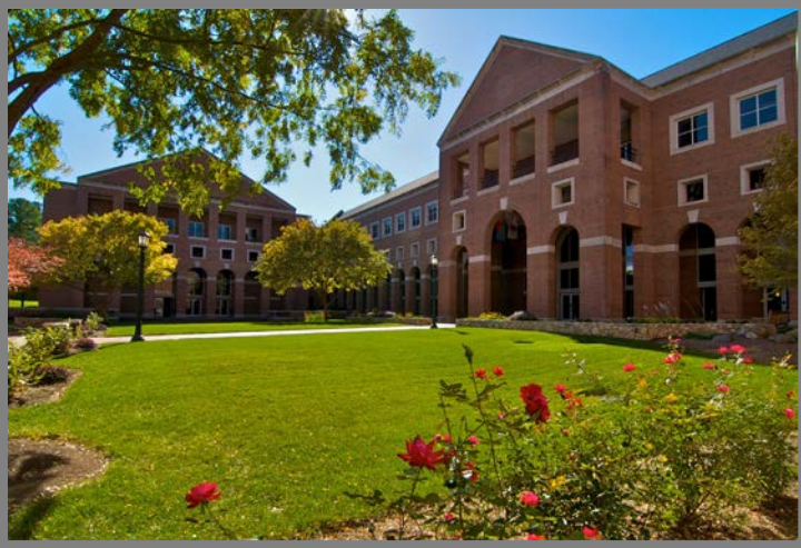
McColl Building, UNC Kenan-Flagler Business School