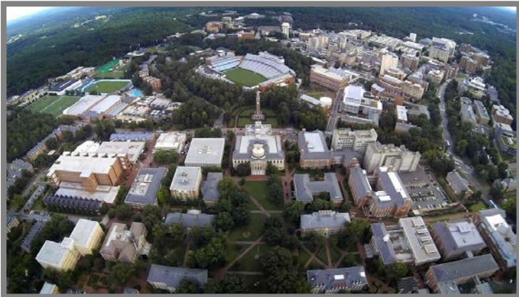
UNC Campus, areal perspective