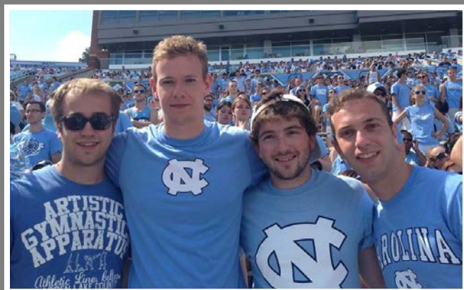
MBA Exchange Students fall semester 2013:

Exchange Students are required to meet the same academic eligibility standards. Exchange students failing to meet eligibility requirements during their studies at UNC Kenan-Flagler, will have their home institution formally notified of their academic standing.