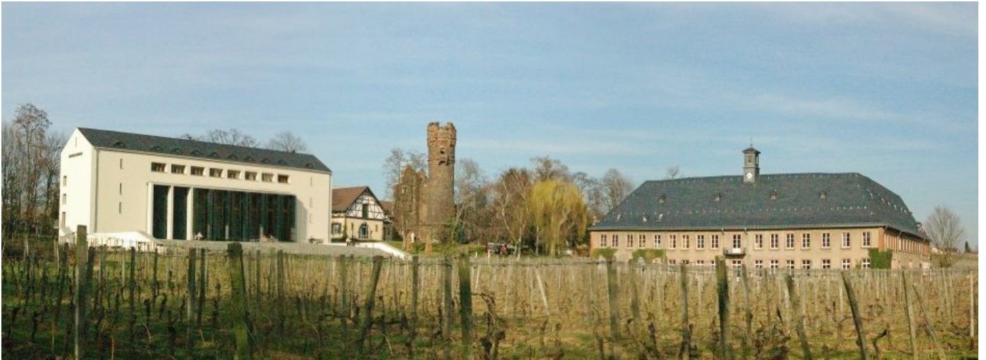
Panoramic view of the EBS Schloss Campus