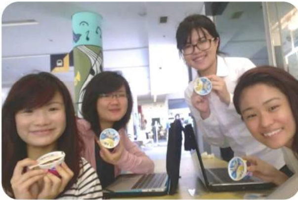
My Group Project Members

Students in Singapore are friendly and well prepared. When there is an upcoming project, they would rather start doing it right away than keep it up until deadline. They are taught to be hard-working and fair which allow them to be able to organize the job into separate parts for members in the team to do and finish job in short time with very nice quality.