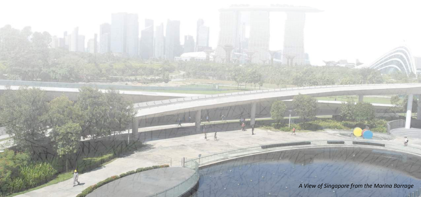
A View of Singapore from the Marina Barrage