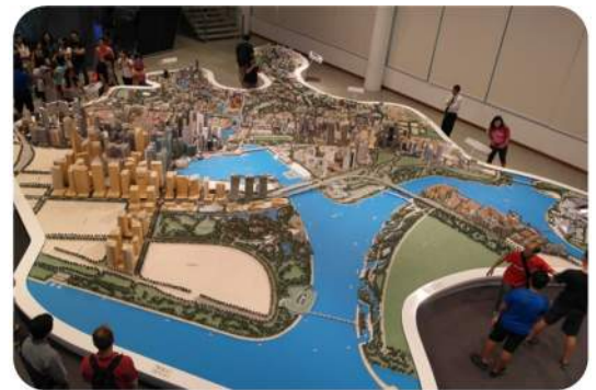
Singapore City Model

The authority of Singapore requires exchange students to go to Singapore about a week before the semester actually begins in order to process student's card. This also give an opportunity to do the EZ Link card, a universal card for paying the MRT ride, Bus ride, printing and copying in the university. And in this given period, you should be able to learn the map of Singapore at least how to travel to the university from our dormitory. Singapore is well organized city when you have a closer look of how buildings are organized and showed on the map, travelling in Singapore will be very easy.