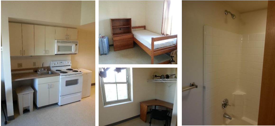
Neil Building: A Kitchen and A Bathroom with A Toilet

Meal plan: You would have to get a meal plan of either 350 Block or 450 Block; 1Block = 5 Dollar. I pick 350 Block which is more than enough to survive 1 semester and typically per meal I use 2 Blocks. With occasionally cooking for myself and eating out.